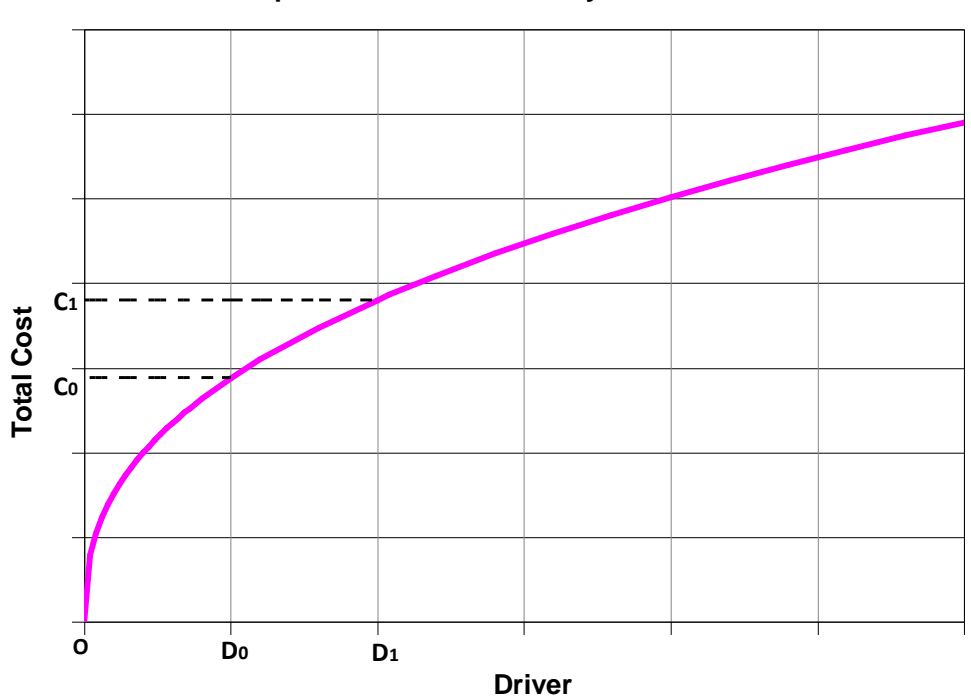
Figure 1 Example of Constant Elasticity Cost Function